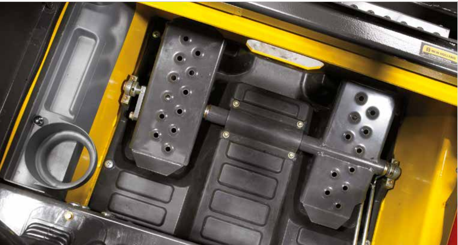
The step floor is leveled for easy entry/exit and there is more room for leg and foot.