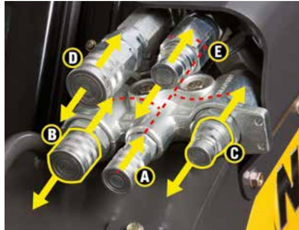
Optional high flow aids