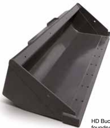
HD Bucket for foundry and grounding

*Other buckets will be available as spare parts