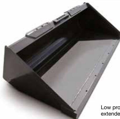
Low profile extended bucket