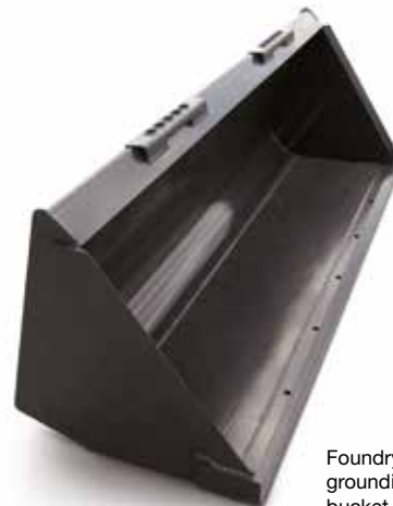
Foundry and grounding bucket